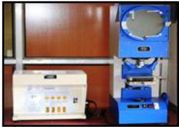
Profile Projector (Rs.48,825/-)