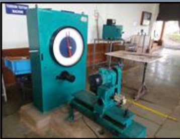
Torsion Testing Machine (Rs. 83,500/-)