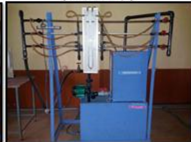
Flow through Pipes- Major Losses (Rs. 42,000/-)