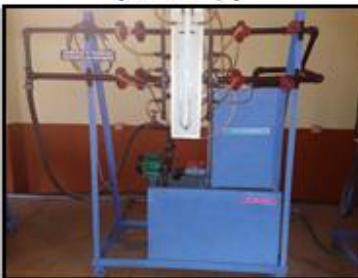
Calibration of Flow Meters (Rs. 42,000/-)