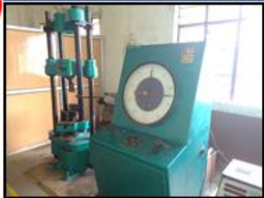
Universal Testing Machine (Rs. 1,51,500/-)