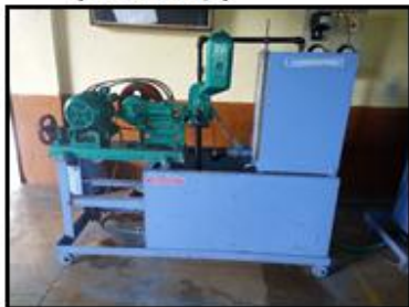
Reciprocating Pump Test Rig (Rs. 42,000/-)