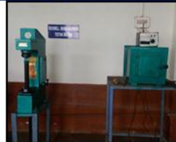
Material Technology Lab (Rs. 79,115/-)