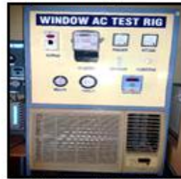
Window AC Test Rig (17,933/-)