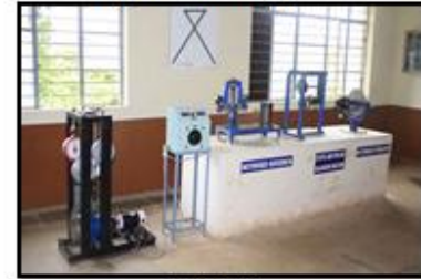
DOM Lab (Rs. 1,55,250/-)