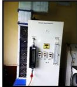
Cooling Tower Test Rig (Rs. 72,000/-)