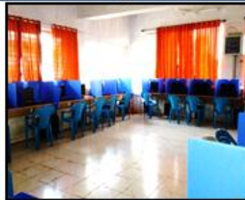
CAD/CAM/CAE (Rs. 42,66,755/-)