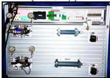
Electro-hydraulic Trainer Kit (Rs.2,32,875/-)