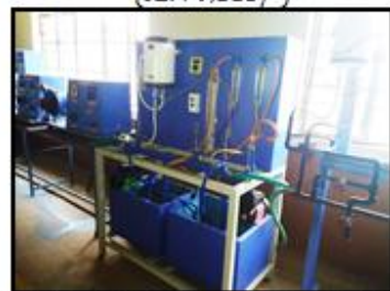
Refrigeration and Heat Transfer Lab (5,01,083/-)