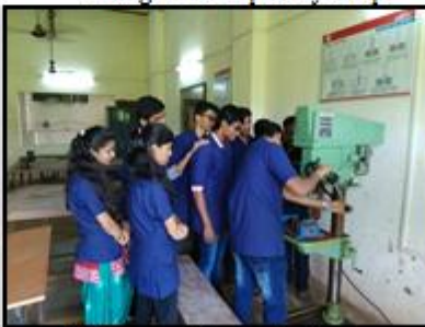
Fitting and Carpentry Shop