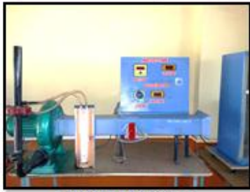
Pin Fin Apparatus (Rs.18,400/-)