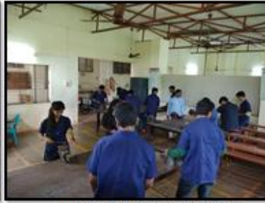
Fitting and Carpentry Shop