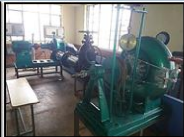
Kaplan Turbine (Rs. 3,20,000/-)