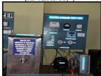
Vapor Compression Refrig. Set Up (19,508/-)