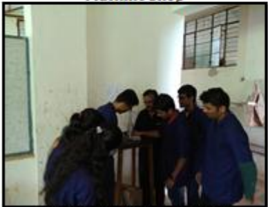
Fitting and Carpentry Shop