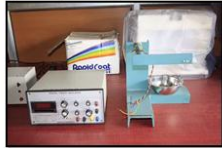
Measurement and Metrology Lab (Rs. 3,59,880/-)